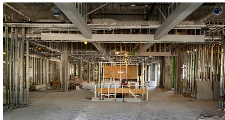
Main Entrance and Welcome Center