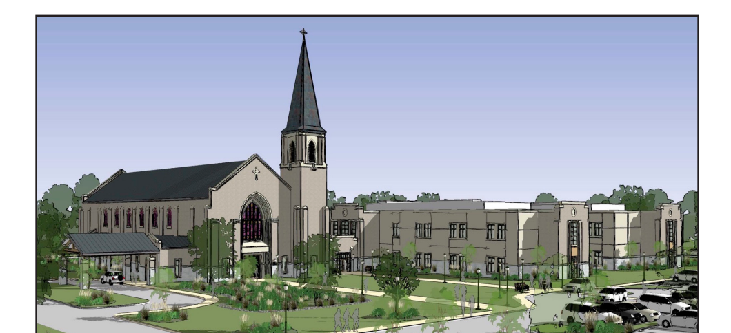
September 29, 2019

Church Office: 7000 Executive Center Drive, Suite 125 Brentwood, TN 37027 | 615-965-5519 www.stephensvalleychurch.com